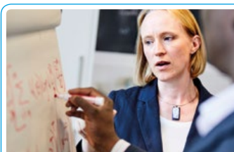
Investing in science and technology