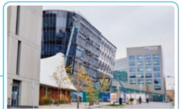
Investing in future cities

We have put over £19 billion into direct investments