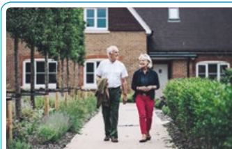
Investing in later living homes