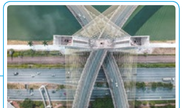
Investing in the US